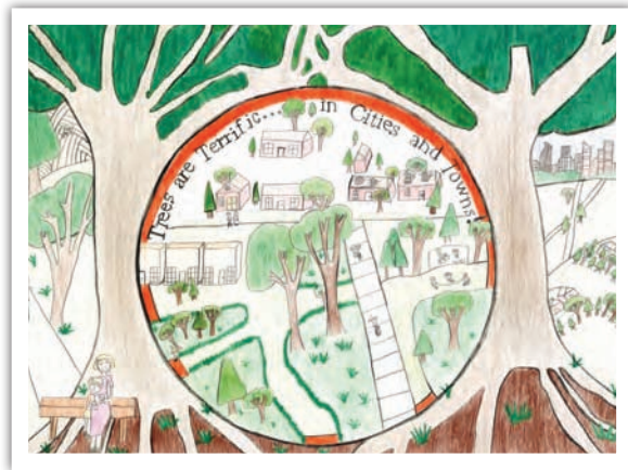
(Bottom Right) 2009 Nebraska State Winner