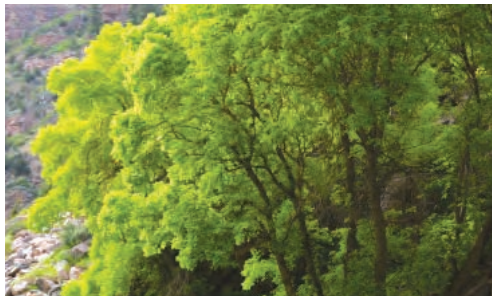
Nebraska's state tree is the Cottonwood.